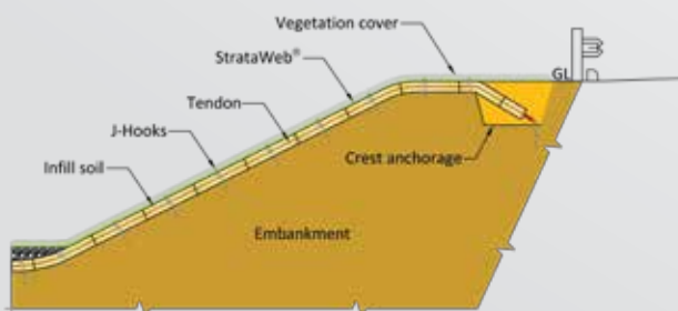
Schematic diagram for slope erosion control

StrataWeb® prevents slope soil erosion of embankments and dressed natural slopes. The panels are laid over the slope to be protected and anchored by spikes along the slope and or anchor trench at the crest. StrataWeb® panels are held together by StrataCord® tendons and StrataLock® clips. StrataWeb® cells may be either filled with soil that can be vegetated, or lean concrete.