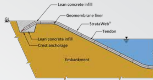
Schematic diagram for geomembrane protection on slope

In these applications, cells of StrataWeb® are generally infilled with lean M15 concrete. In case of landfill covers over geomembranes on outer slopes, infill of vegetated soil is preferred to give a green appearance.